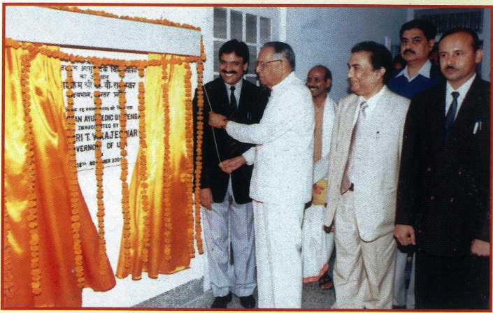
18th November, 2004 - H.E. Sri T.V.Rajeswar, Governor, Uttar Pradesh, inaugurating the newly constructed building of Rajbhawan Ayurvedic Dispensary.