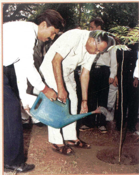
29th October, 2005 - H.E. Sri T.V. Rajeswar, Governor, Uttar Pradesh, planting the sapling of "Reetha" tree in Dhanvantari Vatika on the occasion of Dhanvantari Jayanti.

Ayurveda also prescribes "Rasāyans" to purify and re-vitalise the cells. Rasāyans are the essence of fruits and herbs brought together to build the molecules thereby balancing the body. Some powerful Rasāyans are : Indian goose berry (called Amla), Haritaki ( Terminalia Chebula ) and Ashwagandhā ( withania somnifera ). They Rejuvenate the body.