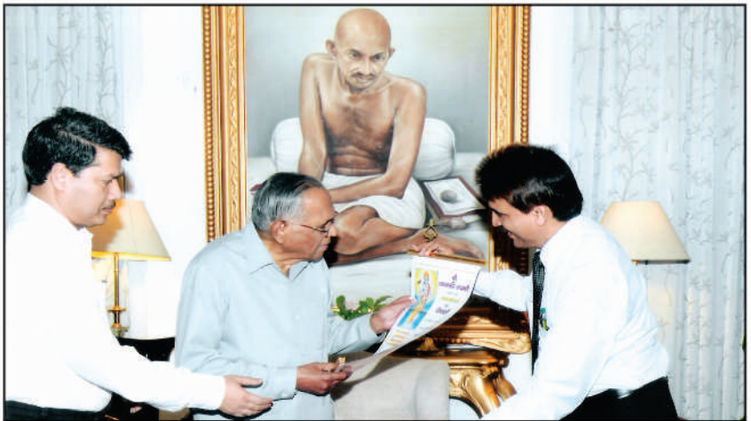
27 th October 2008 - On the occasion of Dhanwantari Jayanti, The Hon. Shri T.V. Rajeswar, Governor, Uttar Pradesh being presented a Calendar of Lord Dhanwantari wishing health & longevity.