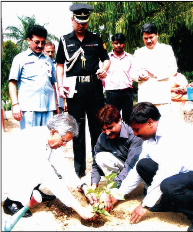
2 nd October 2009 - H.E. Shri B.L. Joshi, Governor, Uttar Pradesh, planting the sapling of Aegle marmelos (Bael) in Raj Bhawan, Uttar Pradesh.

Botanical name – Azadirachta indica Parts used – Seeds and leaves